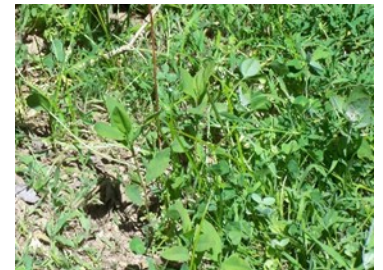
Erect Knotweed Phalaris caroliniana