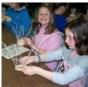
Students learn the craft of basket weaving.