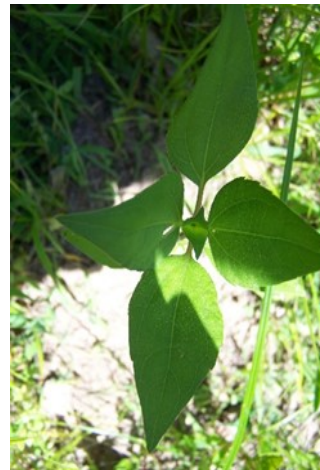
Sump Weed Iva annua

We planted the seeds and crossed our fingers and we are happy to report that we have some maygrass, sumpweed, chenopodium, and erect knotweed growing! We will be able to collect seed for the seed bank and for another planting next year. We also have some wild squash plants growing planted by Rogers Park 6 th graders in early May. Dry weather and very tough soil have slowed down our ambitions for this year a little bit, but progress has been made and we will continue to work towards an expanded interpretive garden. Be sure to follow the progress on our Facebook page in the EAC Garden album or visit us on Archeology Day and take a tour.