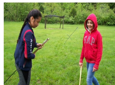
Many find it very challenging to use an atlatl.